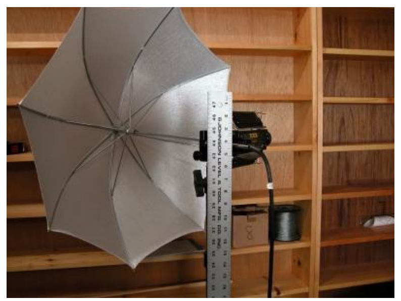
Halogen light on stand, with umbrella

In addition, the lights must be mounted on their stands to the same height as the center of the artwork. Much experimenting must take place. This is how it is done: