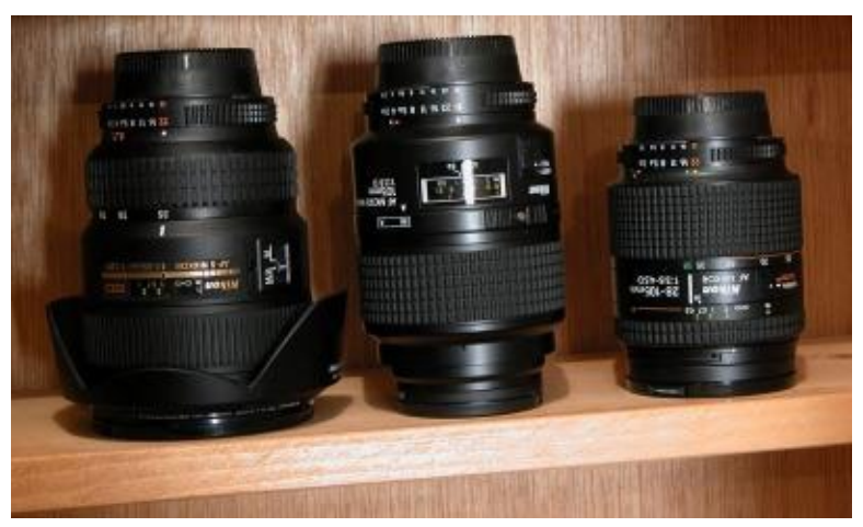
Interchangeable lenses for the Nikon D1x or other DSLRs

In fact only a few of the finest lenses are fit to be used for this kind of work. These are typically called Macro lenses and are generally of a fixed focal length. In other words: no zoom lenses. I experimented with a number of lenses, some fixed and some zoom. In every case, the fixed focal-length lens beat out the zoom for absolute clarity. What this meant for the photographer (which in this case was me) is that posters of a different size meant moving and leveling the camera and tripod each time a different sized poster was encountered -- a major pain. But I went to the trouble, because the end result dictated that this was the way to go.