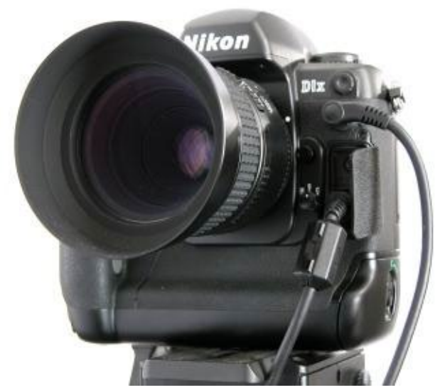
Nikon D1x and portrait lens or any DSLR

The Nikon D1x is essentially a single-lens reflex camera (like the 35mm varieties), but with much greater resolution than most of the other digital cameras on the market, some 5.4 mega pixels. What this means for us is that the D1x is capable of capturing and storing an image that will reproduce as a 6x10-inch full-color photo at 300 dpi. In other words, it produces an excellent image the size of about the largest image in a book like "The Art of Rock." The fact that most posters are much less complex than, for example, nature photos suggests that poster images could probably be expanding to an even larger size, with no visible loss. Certainly, that is all that we need.