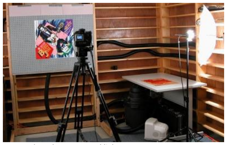
Vacuum board, camera, and lights

As for camera settings, you will have to experiment. The rule of thumb for getting the most out of your lens is to open it up as wide as you can and take shots of some detailed pattern, type, or poster. Then gradually close the aperture, taking shots as you step it down. The idea is to try different apertures with different lens speeds. Take notes for each photo of what aperture and speed the lens is set at. Then take these shots into Photoshop and examine them. You will quickly see what combination of aperture and lens-speed produces the greatest clarity. Look for the fine print. Depending on the type of camera you use, some attention must be paid to the matter of White Balance, using a white or gray sheet of paper.