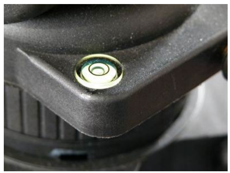
Bubble level as part of the tripod head