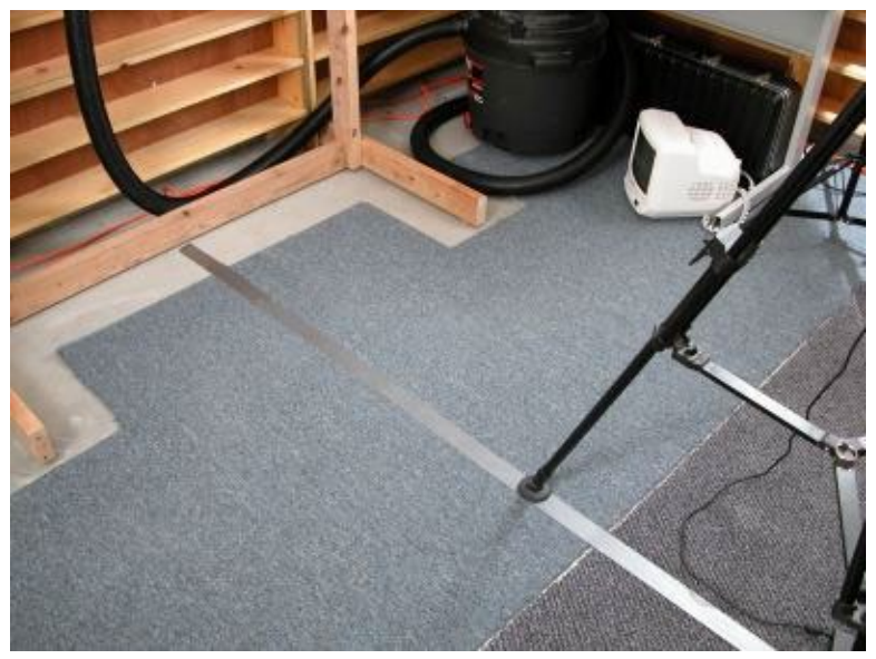
Keep the camera in line with the board

The camera also needs to be leveled on the tripod, both from right to left and from forward to back. I my case, I purchased a special eyepiece lens that had a grid engraved on it, which allowed me to better balance the camera, from right to left. As for front and back, I used a small (8 inch) carpenter's level, which I placed vertically against the front of the camera lens hood. The plane of the camera and the plane upon which the poster is placed must be parallel.